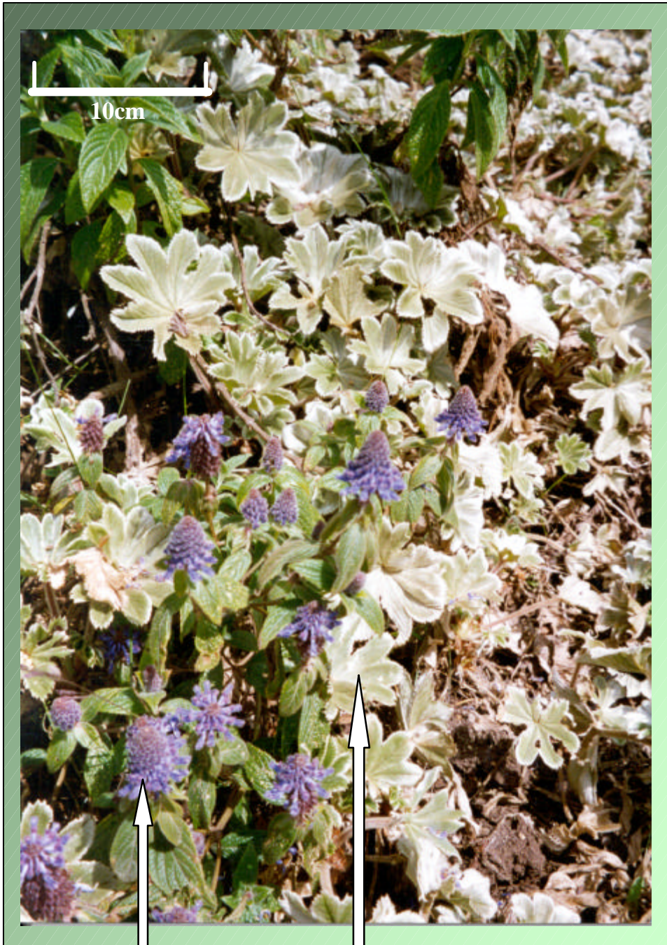
Pycnostachys meyeri Gürke (Labiatae)

local name: mbakilum (Oku) = ‘clouds on the mountain’