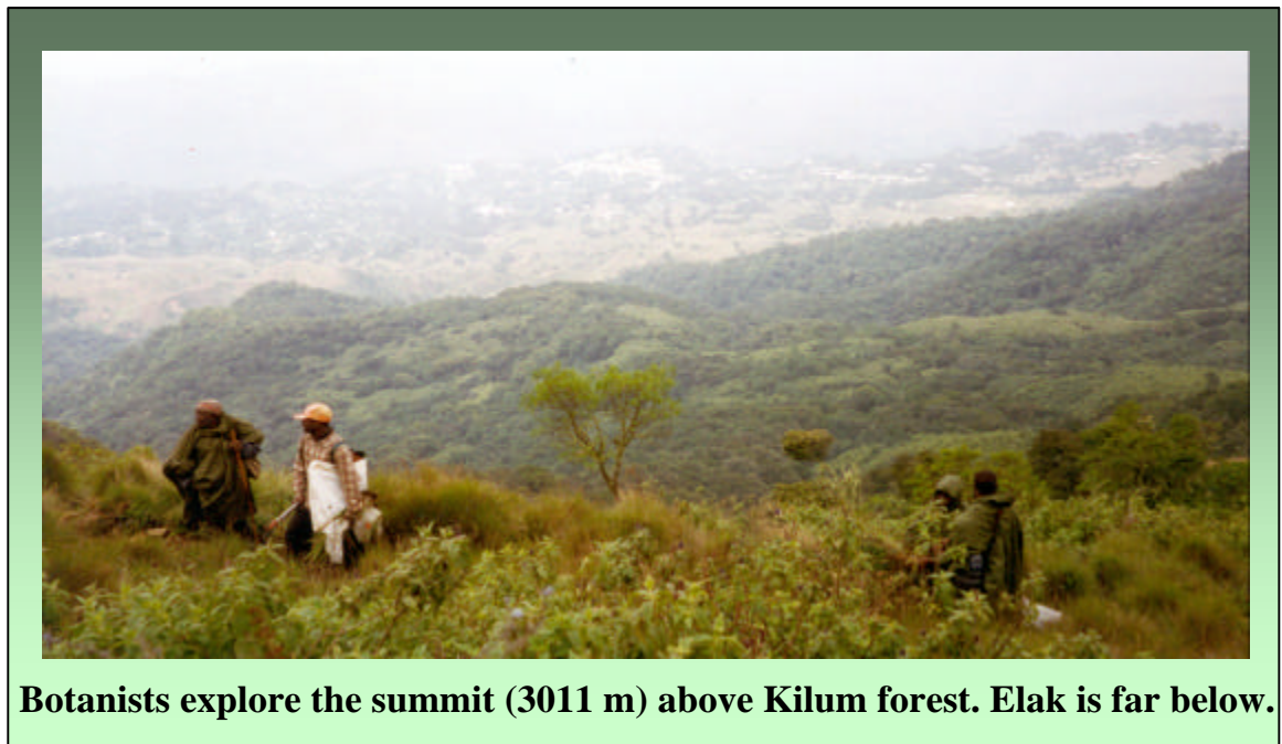
Botanists explore the summit (3011 m) above Kilum forest. Elak is far below.