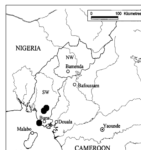
Distribution map of Impatiens frithii

Impatiens frithii is known from only three localities: two in the Bakossi Mountains and one at Mount Etinde, near Mt Cameroon. This epiphyte occurs in submontane forest, on trees and treelets at least 1.5 and up to 6 m above ground level, between 800 and 1400m altitude. It flowers during the wet season and is inconspicuous unless observed during flowering.